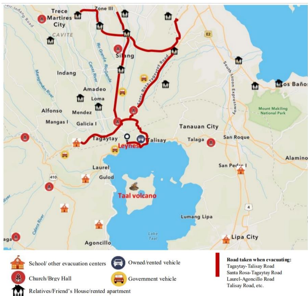
Figure 2. Evacuation mode and destination choice of household respondents in Barangay Leynes, Talisay, Batangas, Philippines.

respondents got their source of evacuation warning from government officials/agencies while 45 respondents got it from media outlets or social media. 56.63% of the respondents traveled more than 25 km to reach their accommodation type choice. One-hundred-two (102) household respondents stayed in their accommodation choice for a month or more while 64 of them stayed there for less than a month. For better visualization of evacuation behavior, Figure 2 shows a map of the evacuation movement of the household respondents when evacuating after the Taal volcano erupted in 2020. The map shows the type of transport mode (either government vehicle one or owned/rented vehicle) used when going by the indicated road taken from residential area in Leynes to either their friends/relatives house or rented apartment or to any designated evacuation center.