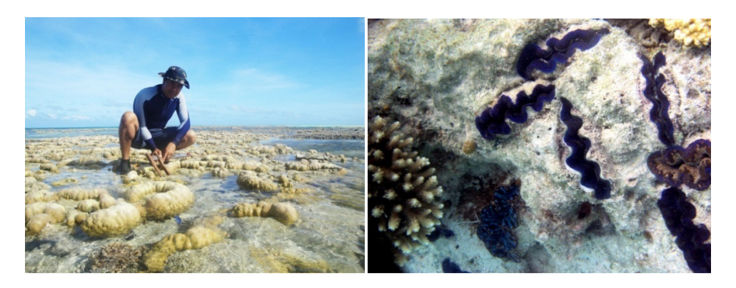
Figure 1. Measuring the shell lengths of T. crocea with the use of calipers (left) and a close-up view of several individuals embedded in exposed coral rock in Tubbataha Reefs Natural Park (right).

About 14% of samples were very small (10-29 mm) and such may indicate a self seeding reef.