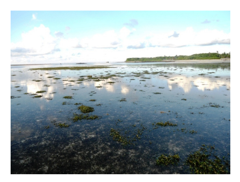
Figure 2. Extensive seagrass in the western side (Station 4) of Pag-asa Island, Kalayaan, Palawan, Philippines.

Figure 1. Map of Pag-asa Island, Kalayaan Island Group, Palawan, Philippines showing the sampling stations.