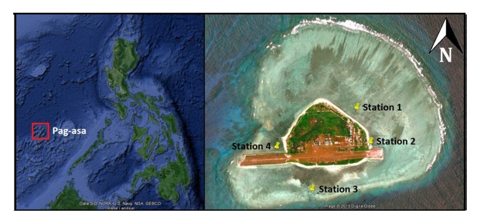
Figure 1. Map of Pag-asa Island, Kalayaan Island Group, Palawan, Philippines showing the sampling stations.