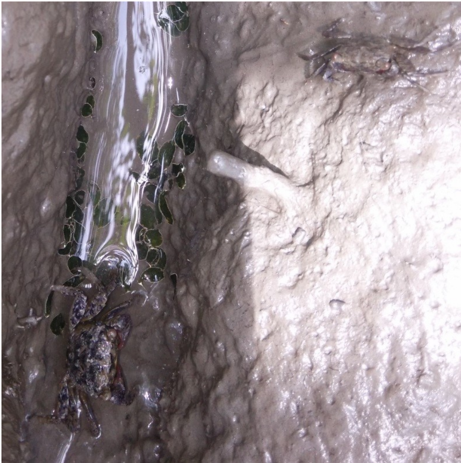
Figure 4. Juvenile mudcrabs pick on individual Elysia leucolegnote in a mudhole.

specifically within the Verde Island Passage is ecologically significant in the biogeography of the group by lending support to Jensen's conjecture that Malaysia-Indonesia-Philippines may be the center of species diversity, being the central point between Japan and Australia where habitat complexity provided for by the archipelagic islands could trap dispersing species and retain them in the area.