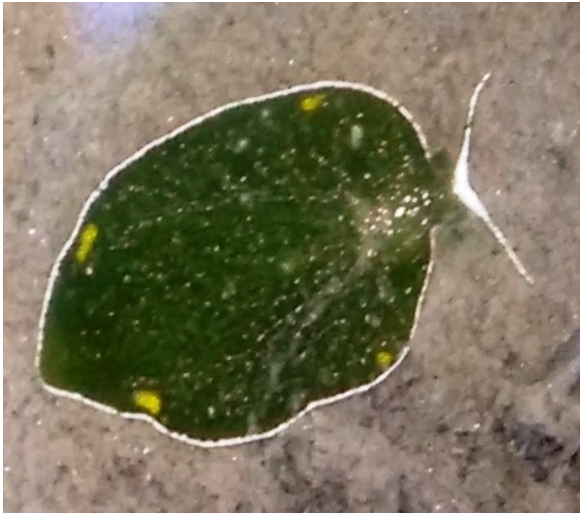
Figure 2. Elysia leucolegnote from Silonay Mangrove Ecopark with white margin on the parapodia, white rhinophores, and a yellow dot on each quadrant of the body.

Aggregations of E. leucolegnote were noted in Silonay Mangrove Ecopark during the mangrove-associated mollusks survey in Mindoro, Philippines. The species measured about 3-3.5cm, was characterized by distinctive white markings around the parapodia and on its rhinophores. The green coloration on the parapodia appears mottled. The specimens found here possess four yellow dots, one of each quadrant near the margin of the parapodia (Figure 2). The dots are also visible on the underside. All individuals observed have white spots on the dorsal side of the parapodia but prominence varied among individuals.