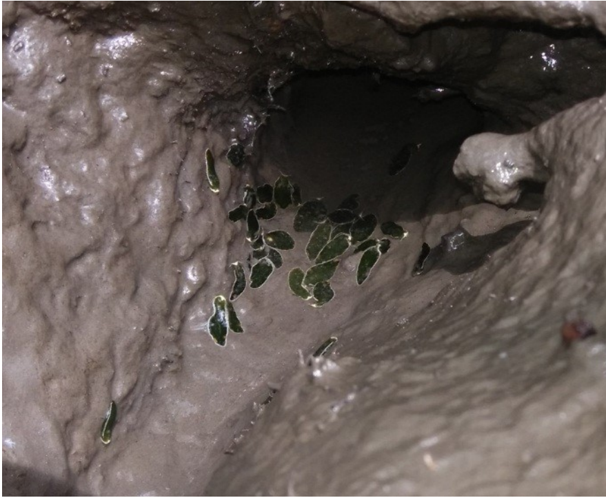
Figure 3. A dense aggregation of Elysia leucolegnote in a mudhole in Silonay Mangrove Ecopark.

There is no recorded predator yet of the species. Crabs, however, were observed to be picking on individuals within aggregations (Figure 4).